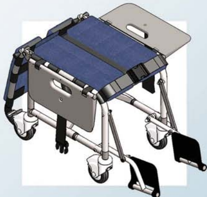
Transfer boards fold flat to facilitate transfer and provide extra seating if required