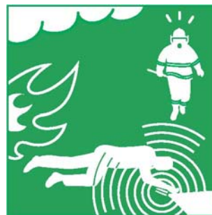
Automatic alarm - be found when time is critical