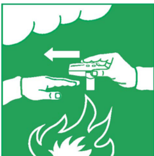
Simply strap on to activate

When the alarm is triggered, not everybody can simply leave the building. For employees responsible for others safety, Evacuaid is a great tool for faster and safer evacuation. Evacuaid is typically wall mounted at strategic places, by fire alarm panels, extinguishers and evacuation equipment or worn on belt.