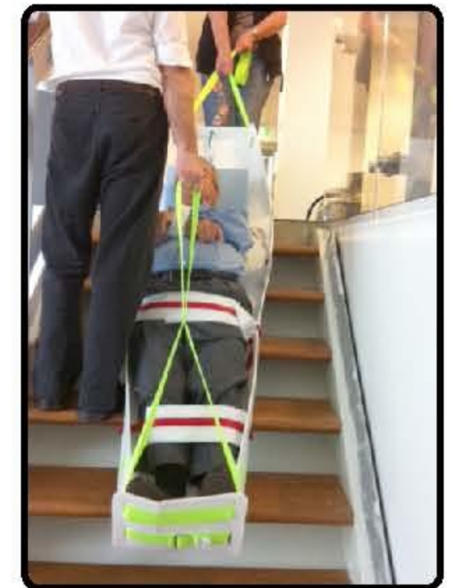
3. Controlled descent