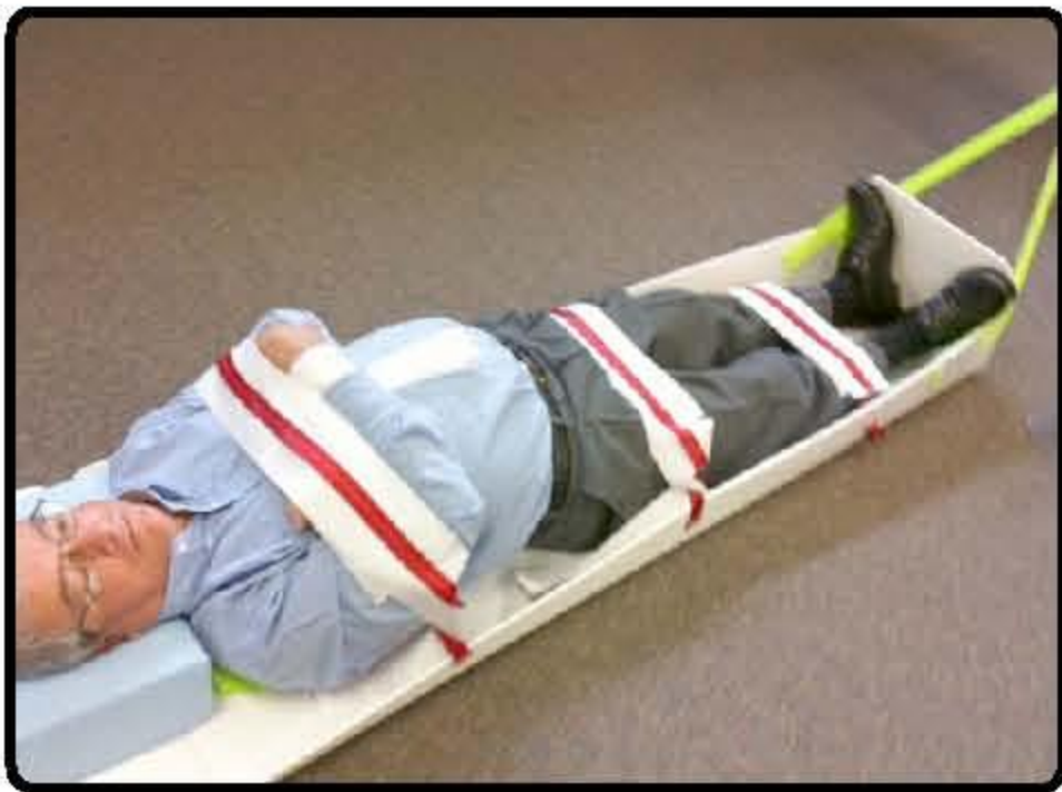
1. Transfer the person on to the ResQme