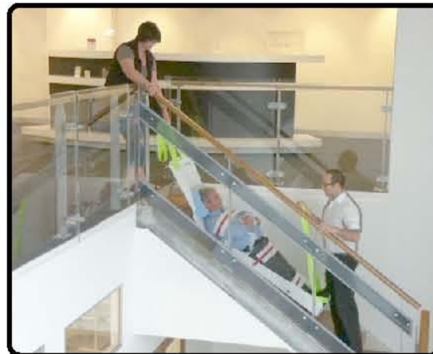
2. Slide down stairs